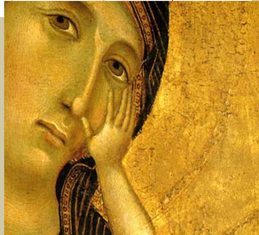
Detail, Cimabue, Madonna and Child, 1285