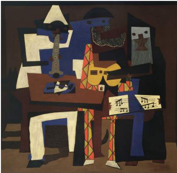
Pablo Picasso, Three Musicians , oil on canvas, 200x230 cm, 1921, New York Museum of Modern Art (MOMA)

If you can imagine the kind of music they are playing, it would sound very different indeed.