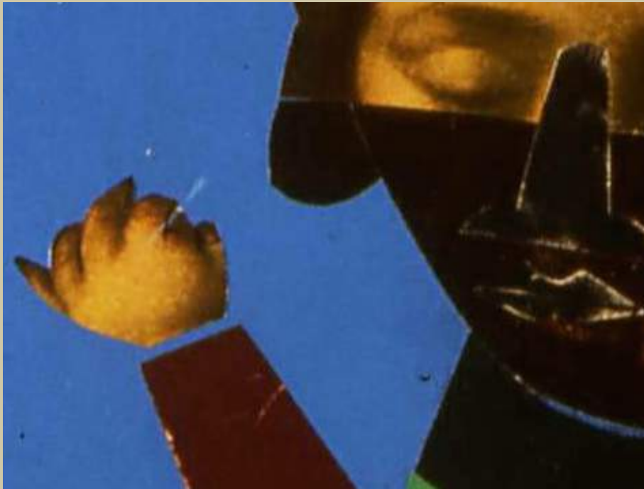
Detail, Romare Bearden, Mother and Child, 1969

The Madonna and child is a symbol of divine love in the catholic tradition, and is recognizable by all people as a symbol of love between mother and child. Cimabue's painting was probably intended as an object of worship, an altarpiece for a church. Bearden has taken the iconography, the formal composition and the tenderness of this classical subject and made his own homage to the mother and child love, a Madonna nera , a black Madonna, framed by bold colors and geometric shapes instead of celestial gold.