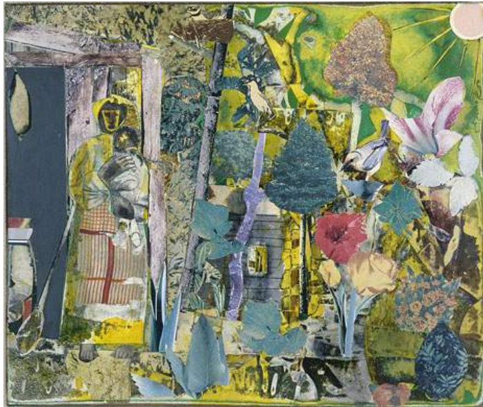
Romare Bearden, Madeline Jones Wonderful Garden, paper collage 1977