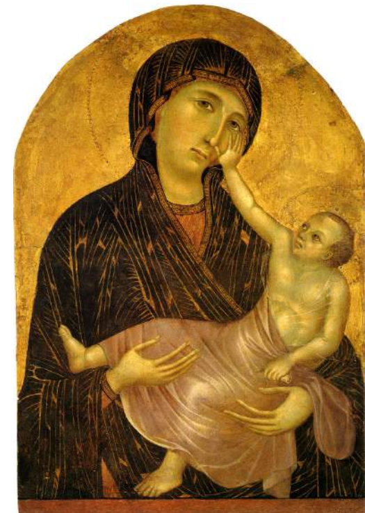
Cimabue, Madonna and Child, 1285

Romare Bearden's striking collage of a madonna and child is a direct homage to the Italian masters of the early Renaissance, in particular the Siennese masters beloved by the artist (Leonardo)