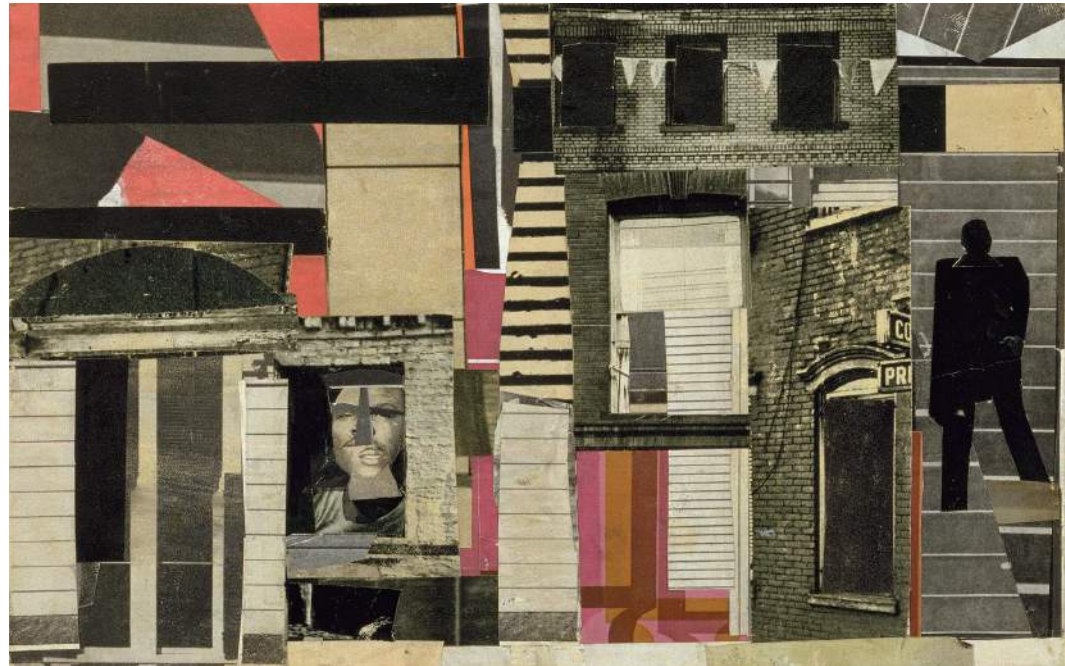
Romare Bearden, The Street, paper and magazine collage, 1964

Although the political and social aspects of his work are widely recognized, the primary concerns of this comparative study are aesthetic: the pictorial influences of other artists and how this manifests in his collage making.