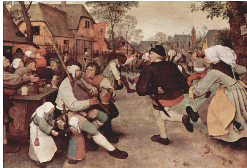
Pieter Brueghel the Elder, Peasant Dance , oil on canvas, 1568