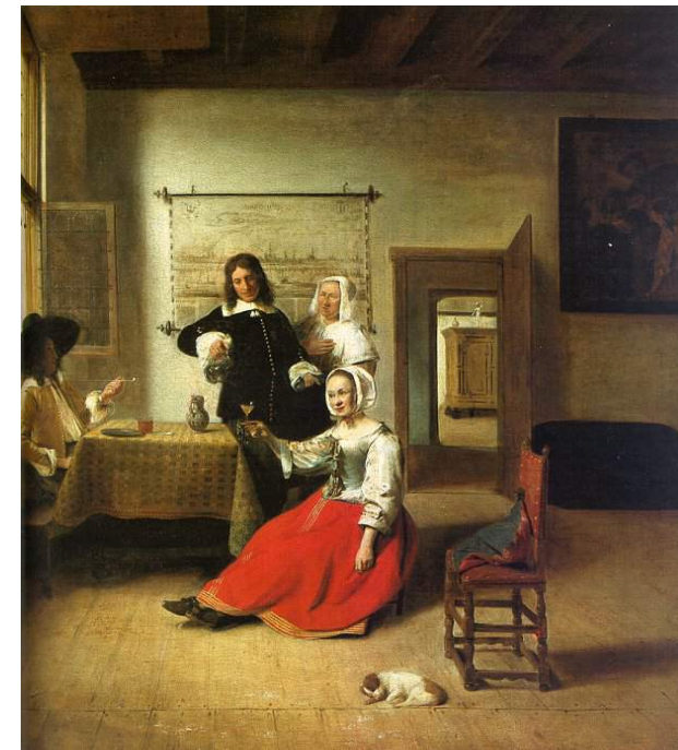
Pieter de Hooch, Woman Drinking with Soldiers, oil on canvas, 1658, Louvre

"I came to some understanding of the way these painters controlled their big shapes, even when elements of different size and scale were included within those large shapes....When I begin a work now...I try only to establish the general layout of the composition. When that is accomplished, I attempt ever more definite statements, superimposing other materials over those I started with." RB (leonardo)