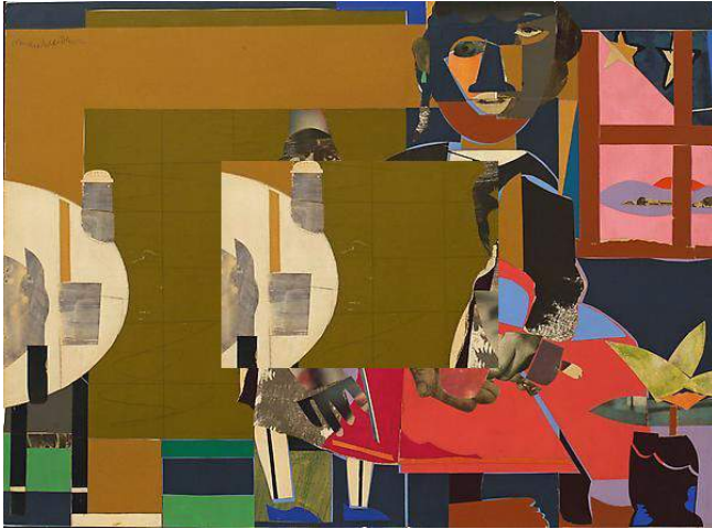
Romare Bearden, Big sister, 1968

Connections through content and form: Domestic Interiors with still life elements... a table, a figure, an open window, are a favorite subject with Bearden, and with Pierre Bonnard too. The structure of these (painting or collages) is again based upon a rectangle within a rectangle, the window opening the picture to another space beyond. The cut off oval of the table appears in all three pictures too, it's elliptical shape softens the rigor of the rectangular structures. Both Bonnard and Bearden use warm, saturated colors, with accents of cool lavender. In all three, the figure is a presence, but not the primary subject.