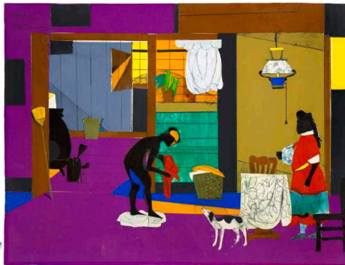
Sunrise, the china lamp, Romare Bearden, paper collage 1985

His late collages rely much less on sourced printed material and are almost exclusively made from paper he hand colored and cut. In Sunrise the China Lamp , a collage from 1985, there are no cuttings from magazines, everything is painted or drawn by the artist. The flat, brilliant planes of color recall late Matisse paper cut outs.