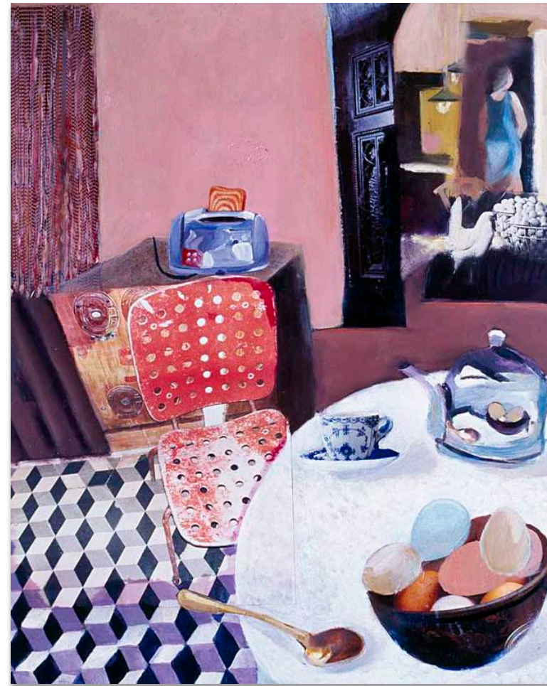
Breakfast, collage/painting by Heather McReynolds