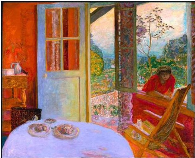
Pierre Bonnard, Dining Room, oil on canvas, 1913