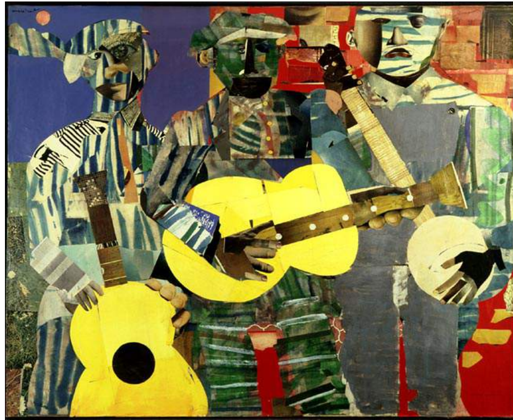
Three Folk Musicians, Romare Bearden, paper collage, 1967

Music was a recurring theme throughout his work, Bearden often included references to both both jazz and blues in his art, evoking historical memory and narrative but also drawing parallels to the use of improvisation in his art making and in jazz musical structures. His use of texture and rhythm has been compared to the riffs, thematic variations and call and response techniques used by jazz musicians like Duke Ellington and Thelonious Monk. ( Jazztimes )