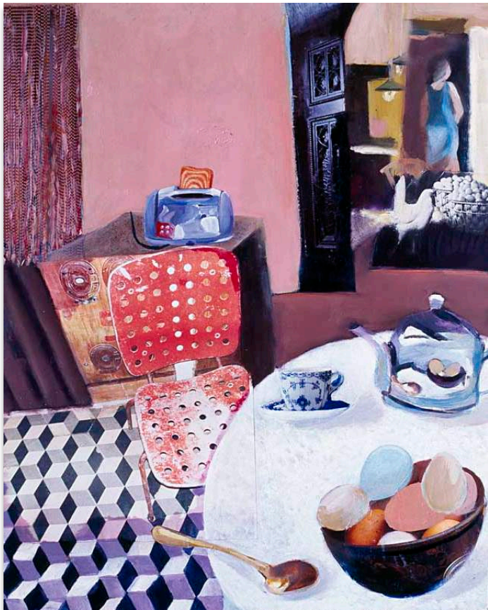
Breakfast, collage and painting by Heather McReynolds

My collage depicts a familiar scene of a table laid for breakfast, toast popping up, eggs boiled, tea steeping. Beardens shows a rural scene perhaps at sunset, of people on the porch, doing chores or just basking in the evening light. Both evoke a sense of place, of home, of intimacy.