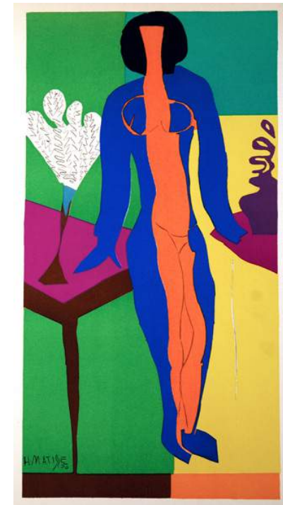
Henri Matisse, cut paper collage, 1950