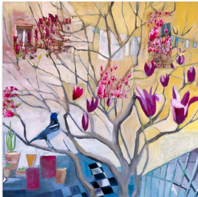
Heather McReynolds, Magnolia , collage and oil painting on canvas, 100x100 cm

And some aspects I want to develop or investigate further