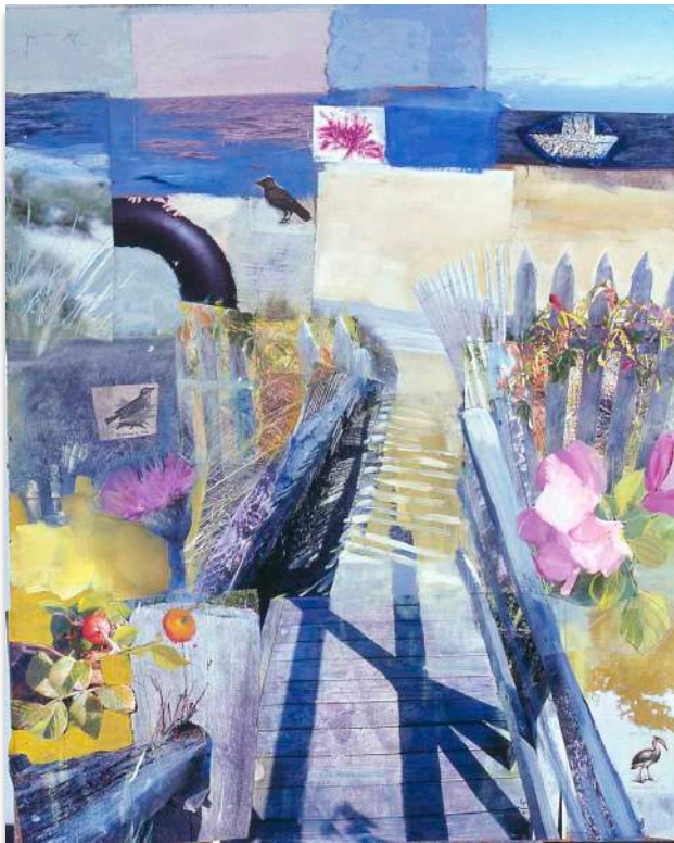
Heather McReynolds, Familiar Path , collage and painting on wood panel, 50 x40 cm