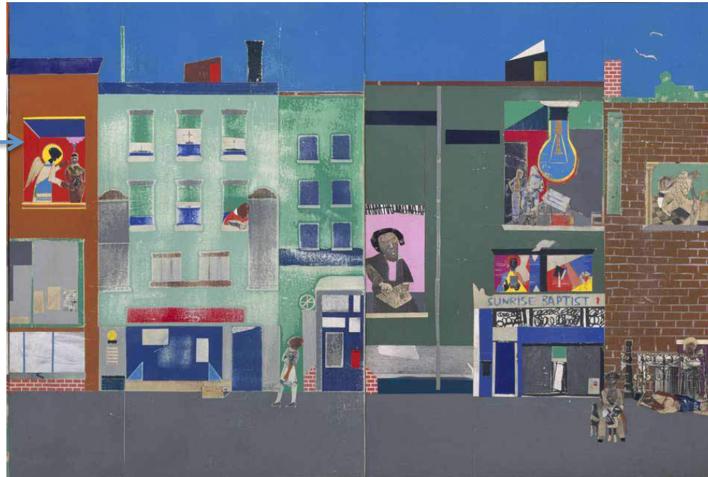
Romare Bearden (American, 1911–1988), "The Block", detail, 1971. Cut & pasted printed, colored and metallic papers, photostats, pencil, ink marker, gouache, watercolor, and pen and ink on Masonite, 48 x 216 inches. The Metropolitan Museum of Art, Gift of Mr. & Mrs. Samuel Shore, 1978 © Romare Bearden Foundation / Licensed by VAGA, New York, NY.