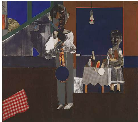
Romare Bearden, the woodshed, 1969

I analyzed Bearden's collages and found the golden rectangle is often the structural basis for his compositions.