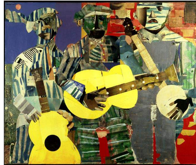
Three Folk Musicians , Romare Bearden, paper collage, 1967