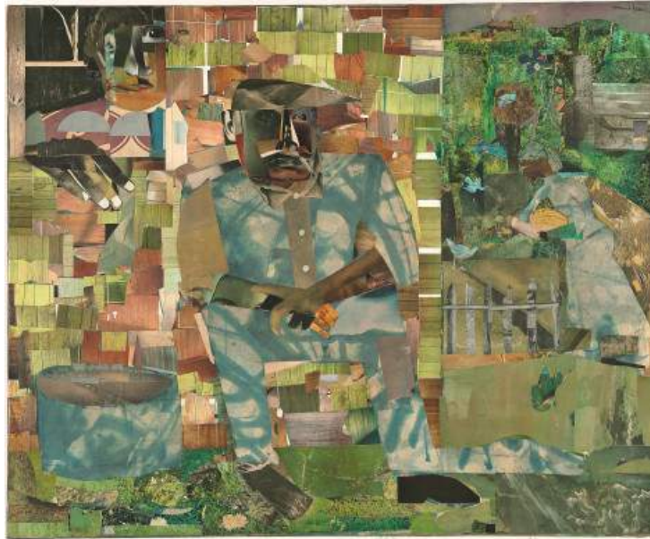
Romare Bearden, Tomorrow I May Be Far Away , 1966/1967 collage of various papers with charcoal and graphite on canvas, National Gallery of Art, Washington, Paul Mellon Fund