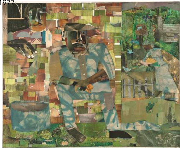
Romare Bearden, Tomorrow I May Be Far Away , 1966/1967 collage of various papers with charcoal and graphite on canvas, National Gallery of Art, Washington, Paul Mellon Fund