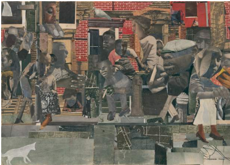
Romare Bearden, The Dove , paper collage, 1964

"it is not my aim to paint about the negro American in terms of propaganda...I paint the life of my people as I know it, as passionately and as dispassionately as Breughel painted the life of the Flemish people of his day....my intention is to reveal through pictorial complexities the richness of a life I know" Romare Bearden (leonardo)