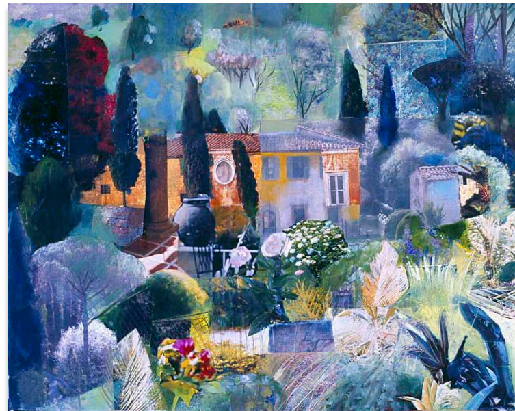
Heather McReynolds, Villa Dreaming , collage and paint on wood

My collage Villa Dreaming depicts an imaginary landscape, composed of fragments of real landscapes pieced together in a hodge-podge way without attempting a logical sense of scale. In Bearden's xxx he pastes oversized leaves and flowers in a flattened, shallow space, evoking a primitive, dreamlike garden. The other Bearden collage xxx, also an enchanted, sun dappled garden, is built on a more grid like structure, each piece of cut paper a building block that is used to construct the picture. Villa Dreaming is also composed of mostly rectangular sections of paper which gives it a cubist, fragmented look. Bearden's collages feature figures from the rural deep south where he grew up and seem to tell stories of people and place. There are no figures in my collage, but it evokes a place where I've lived for many years now.