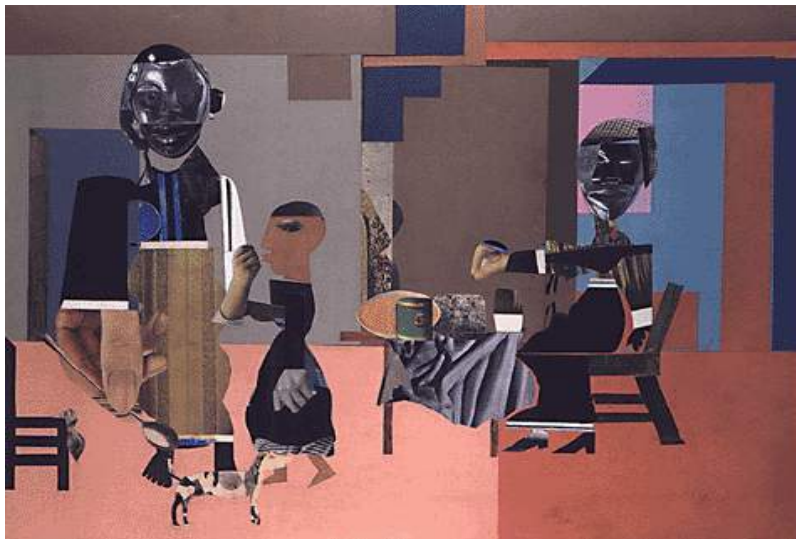
Illusionist at 4 pm , Romare Bearden, Paper collage, 1967

I can also compare Breakfast to these two previously considered images, for their geometric structure and the compositional device of the door opening into another space. In The Illusionist this space is simply suggested by colored rectangles , in de Hooch's a cabinet is visible in a further room. In Breakfast , through the doorway we see a woman with her back turned, a hen and a basket of eggs. The setting in all three is the interior of a house , but the figures play more important roles in both Bearden's and de Hooch's pictures, eating, drinking, providing a glimpse of the intimate life within. Breakfast is more aptly described as a still life, expanding into a domestic interior .