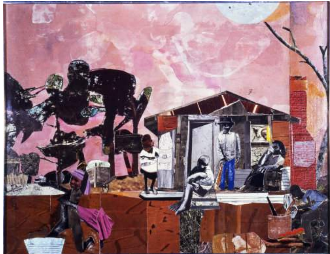
Romare Bearden, Late Afternoon, 1979 Example CS by by Heather McReynolds