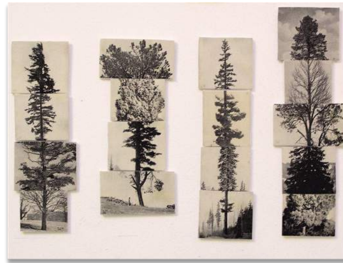
Heather McReynolds, Exquisite Trees , photo collage, wall construction