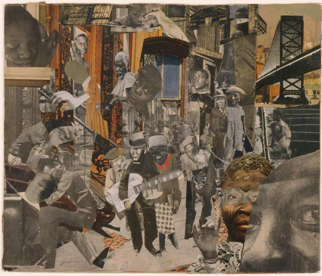
The Street, Romare Bearden, paper collage 1964

In his earlier collages, like The Street , 1964, Bearden used mostly cuttings from magazines and newspapers, resulting in a more neutral, monochrome palette. In the next decade he began to integrate large areas of bright color, cut mostly from colored paper.