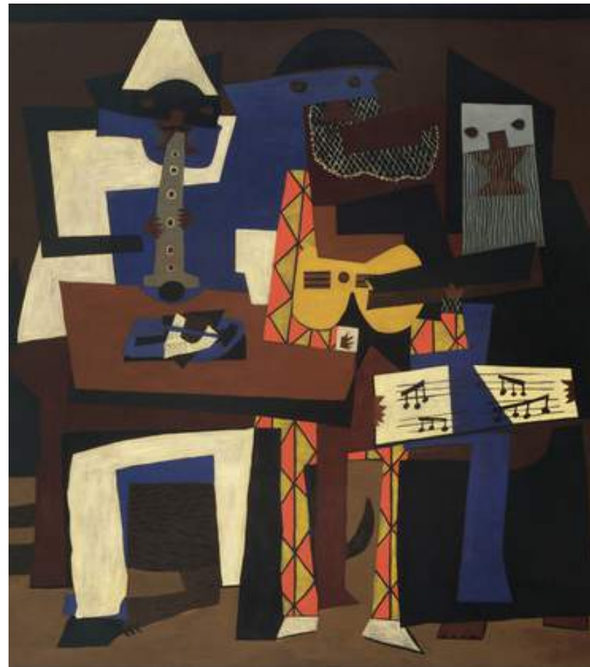
Pablo Picasso, Three Musicians, oil on canvas, 200x230 cm, 1921, New York Museum of Modern Art (MOMA)

This painting by Picasso depicts a masked pierrot, a singing monk, a harlequin and a dog! This playful, whimsical trio possibly represents the poet friend of the artist, Guillaume Apollinaire, who had recently died, and the artist Max Jacob. The faces are mask like rather than portraits.