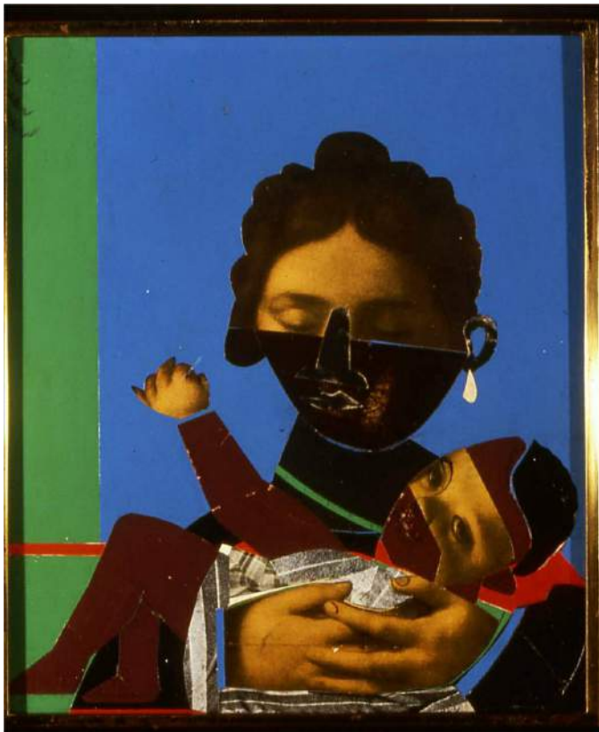
Romare Bearden, Mother and Child,