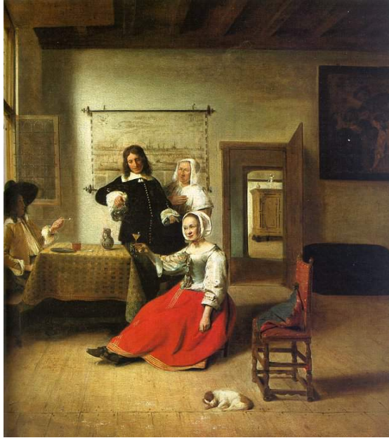
Pieter de Hooch, Woman Drinking with Soldiers , oil on canvas, 1658, Louvre