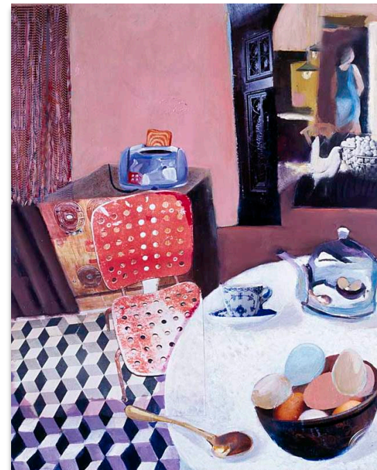
Example CS by Heather McReynolds